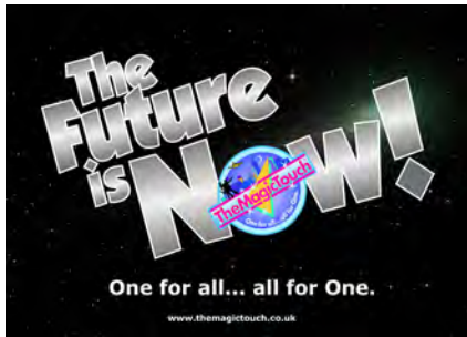
TheMagicTouch Laser transfer papers and equipment