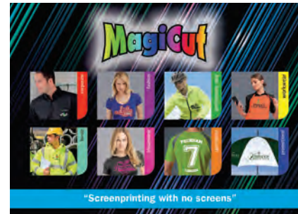
MagiCut Heat transfers films and equipment

Telephone: +44 (0)1582 671444 Facsimile: +44 (0)1582 671555 www.themagictouch.co.uk email: sales@themagictouch.co.uk